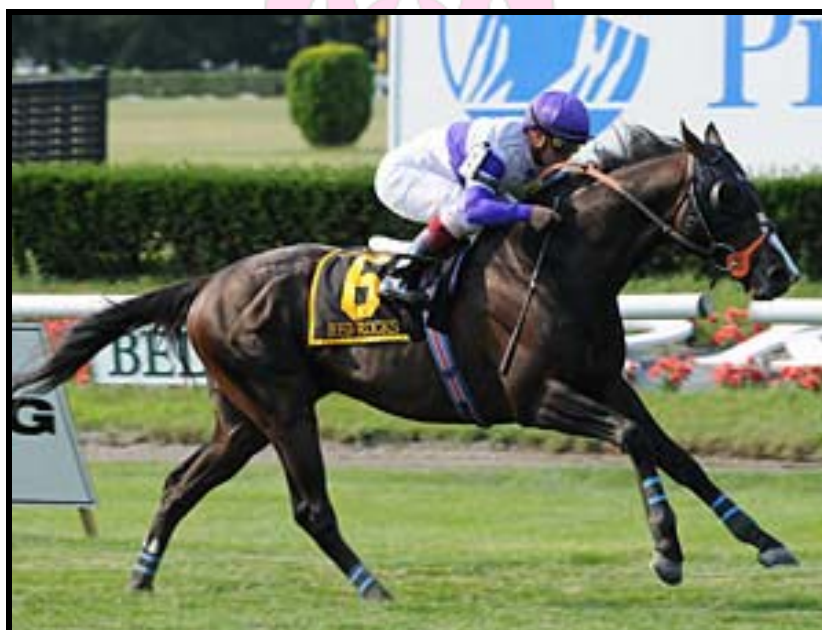
1° Man o'War Stakes (Gr.1) en 2.200 mts. en Belmont Park