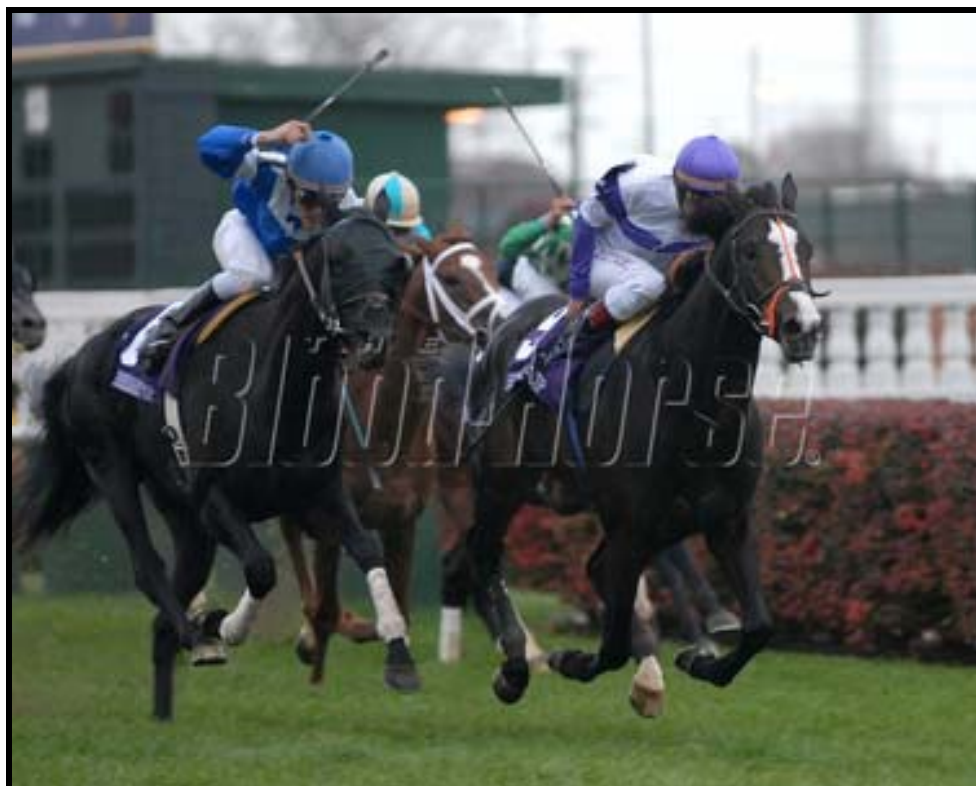
1° Breeder's Cup Turf Classic Stakes (Gr.1) en 2.400 mts. en Churchill Downs