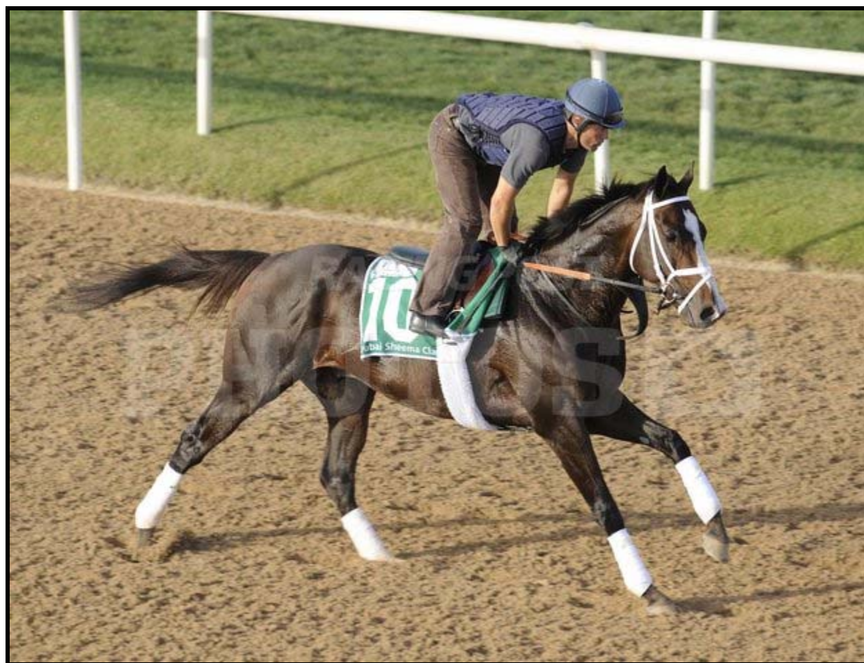
Cotejando en Nad-Al-Sheba