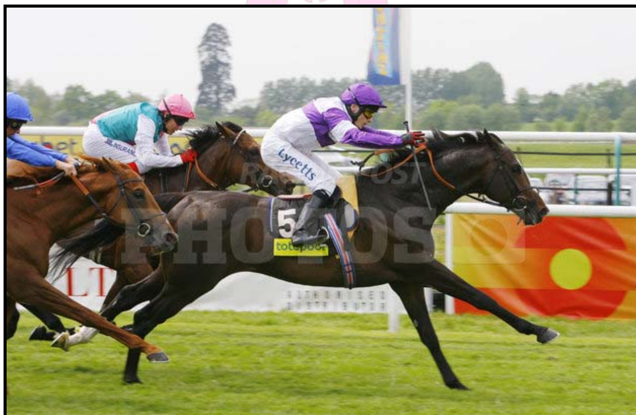
1° Condicional Ganadores (2.000 mts. Lingfield Park)