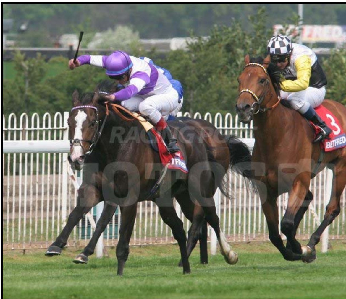
1° Gordon Richard Stakes (Gr.3) en 2,000 mts. en Sandown Park